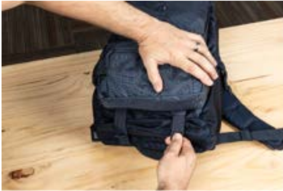
SEMI-PERMANENT SETUP 03: + Pull straps to tighten down