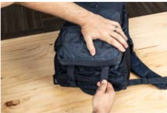
QUICK RELEASE SETUP 05: + Repeat on other side + Pull straps to tighten down