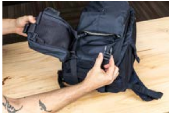
QUICK RELEASE SETUP 04: + Connect S/R buckle