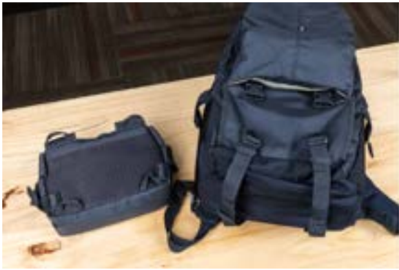
QUICK RELEASE SETUP 01: + Release buckles on backpack