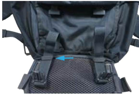
QUICK RELEASE SETUP 02: + Insert buckle through lower webbing loop on back of LV6