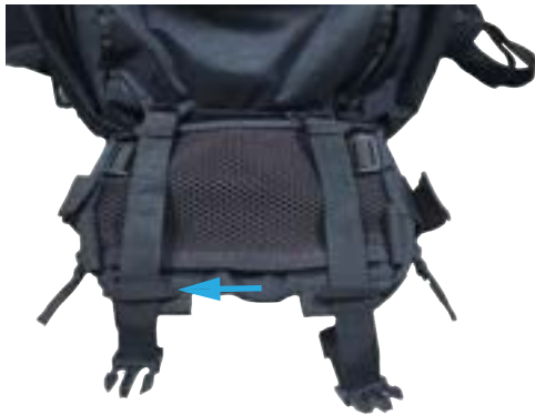
QUICK RELEASE SETUP 03: + Insert buckle through upper webbing loop on LV6