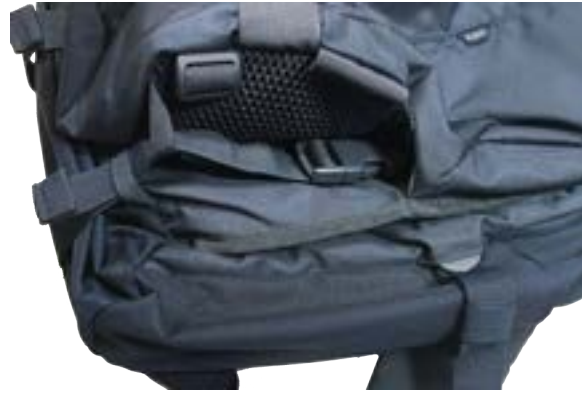
SEMI-PERMANENT SETUP 02: + Connect the S/R buckle