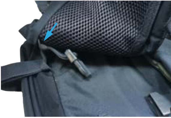
SEMI-PERMANENT SETUP 01: + Insert the S/R buckle through the lower webbing loop on the LV6